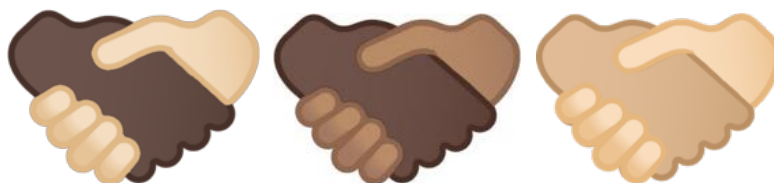
Above: Handshake shown with mixed skin tone support. Mockup based on Google emoji designs.