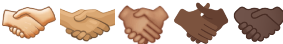
Above: Shared skin tone support is not RGI but is supported by Samsung, Facebook, WhatsApp, Google, Twitter (shown L-R above).